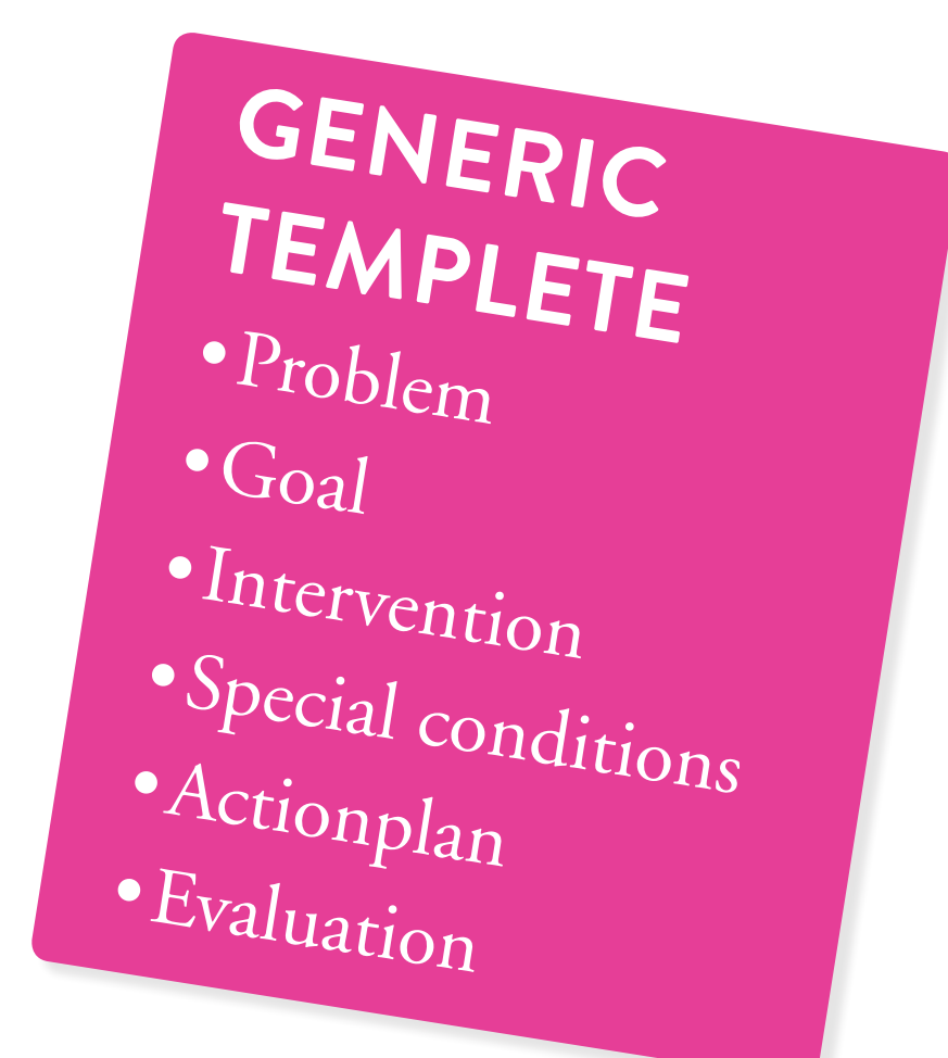
GENERIC TEMPLATE 2017-09-01–2018-02-28